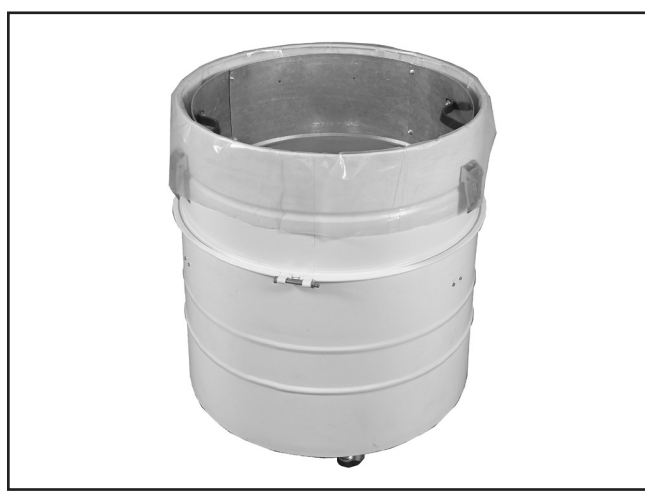
Figure 2. Model H8174 inserted into 50 gallon dust collection drum with collection bag.

Use the Model H8174 bag holder with the dust collection bag as shown in Figure 2 .